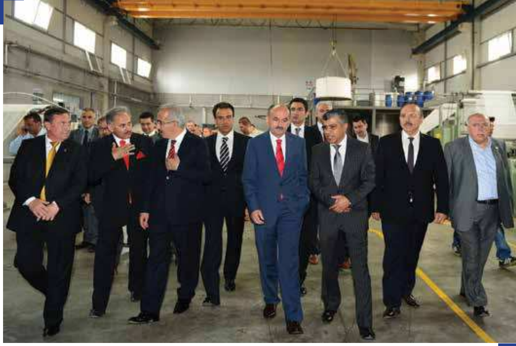
Minister of Health of the Republic of Turkey, Mr. Mehmet MÜEZZİNOĞLU and the Governor of Edirne, Mr. Hasan DURUER visiting our second, state of the art factory situated in the city of Edirne, on the European border and getting information from the senior management.